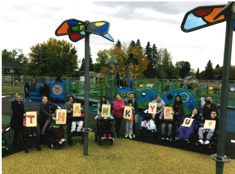
John Dolan School adaptable playground